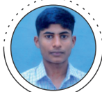
SUHAN 576/600 (96%) Topper in Science